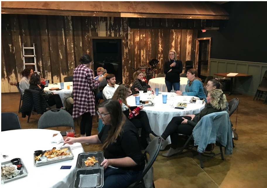
Jones County Young Professionals enjoy a holiday social and business meeting to close out a first successful year!