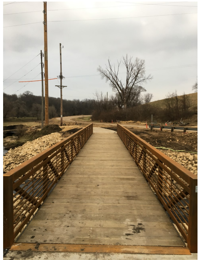
Wapsipinicon Trail Phase 1