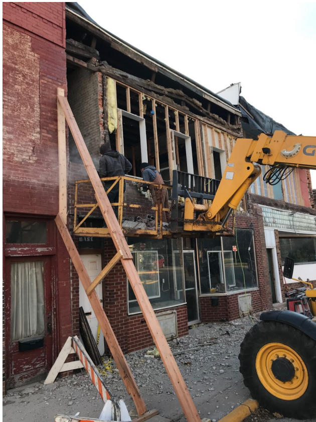
Compadres Building work in Monticello.

Jones County Economic Development is ready to say adios to 2021 and start looking ahead to all of the great projects and goals we want to accomplish in 2022. From finishing projects started in 2021 to new projects on the horizon, JCED is eager to work with our community partners and businesses to make 2022 another successful year!