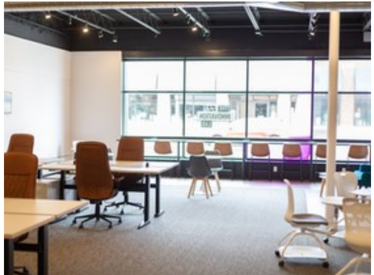
Monticello Innovation Lab Open Space Area

The first iteration of this idea was in the partnership and development of the Monticello Innovation Lab, a place where businesses could go to meet clients, rent some space to get out of the house if needed, and interact with other great entrepreneurs. It also allowed for some direct business coaching and a chance for entrepreneurs to do a small scale test of their businesses after launching. The Innovation Lab had quality internet access, videoconferencing capabilities, private space, and more that would be ideal for early stage entrepreneurs that were not ready to make the commitment yet to a larger space for the business.